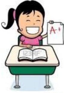
She is doing home work.