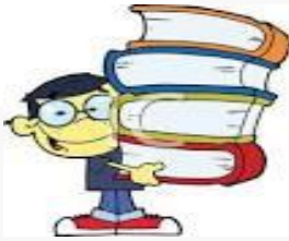
He is holding the books.

Q.89 Look at the pictures given below in which people are doing different activities. Write one sentence for each picture. Use the present continuous tense or ing form of the verb. (20)