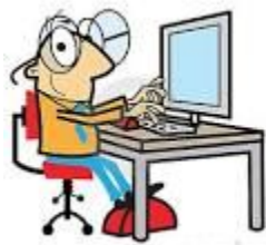
He is working on computer.