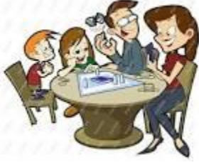
They are playing.

Q.90 Use since and because to complete the following sentences. (10)