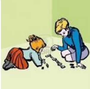
They are playing.